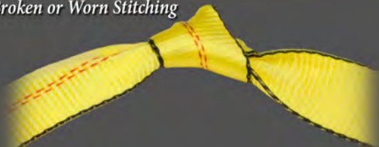
Knots in Load Bearing Portion