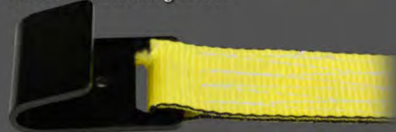
Distortion, Excessive Pitting, Corrosion, or Other Hardware Damage