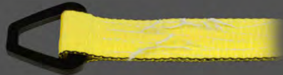
Broken or Worn Stitching