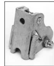
Crosby G-5066 Flapper Latch