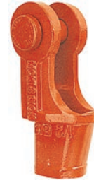
Both styles available with optional McKissick® Wedge Socket Assembly or S-421 TERMINATOR Wedge Socket