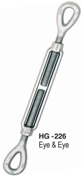
HG -226 Eye & Eye

Meets the performance requirements of Federal Specifications FF-T-791b, Type 1 Form 1 - CLASS 4, and ASTM F-1145, except for those provisions required of the contractor. For additional information, see page 452.