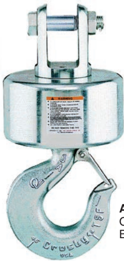
AS-15 Overhaul Ball