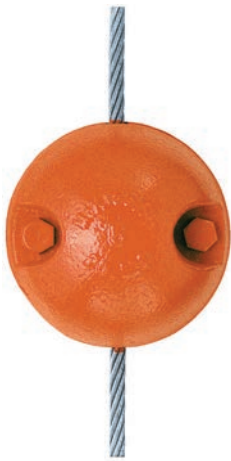
Split Overhaul Ball