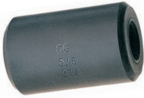
S-409 Swage Buttons