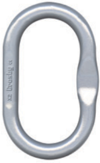
A-1342N Master Link