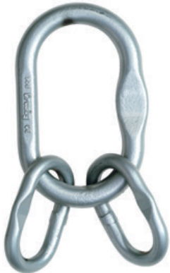
A-1345N Master Link Assembly