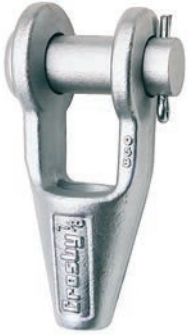
G-416 / S-416

Open Grooved Sockets meet the performance requirements of Federal Specification RR-S-550E, Type A, except for those provisions required of the contractor. For additional information, see page 452.