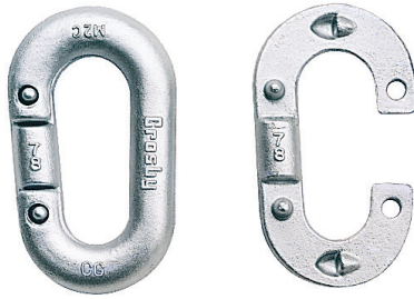
G-334 Replacement Link