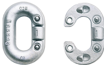
G-335 Replacement Link

* Ultimate Load is 4 times the Working Load Limit. ** Rivets Only - No interlocking lugs. † Has reinforced rivet holes. All sizes have countersunk rivet holes. Not Suitable for use with Grade 80 or Grade 100 chain and chain slings used in overhead lifting.