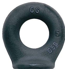
S-264 Pad Eye

*Ultimate Load is 5 times the Working Load Limit.