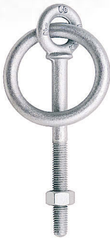
G-257 Shoulder Nut Ring Bolts