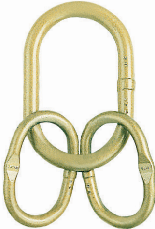
A-347 Welded Master Links

Ultimate Load is 5 times the Working Load Limit. Applications with wire rope and synthetic sling generally require a design factor of 5. Based on single leg sling (in-line load), or resultant load on multiple legs with an included angle less than or equal to 120 degrees. **Proof Test Load equals or exceeds the requirement of ASTM A952(8.1) and ASME B30.9. For use with chain slings, refer to page 240 for sling ratings and page 245 for proper master link selection.