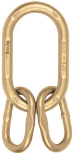
A-345 Alloy Master Links