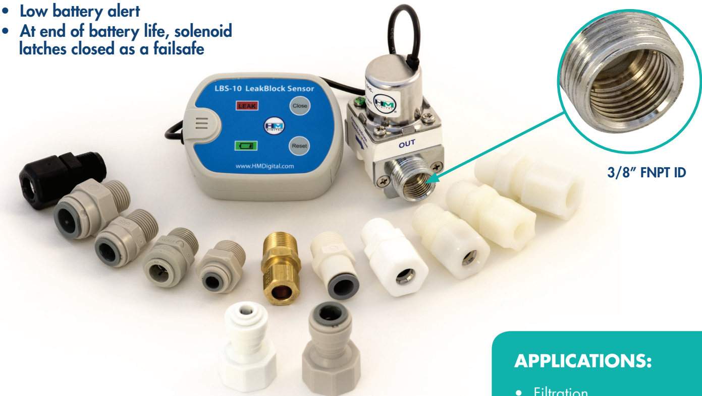
3/8" FNPT ID