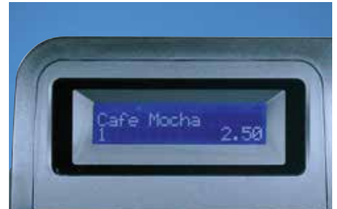
2 Line x 16 Character Backlit LCD Operator and Customer Displays