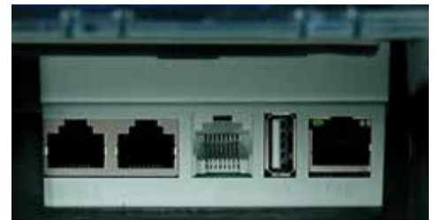
A Combination of 3 Serial, 1 USB and 1 Ethernet Port Are Hidden Behind a Convenient, Easy to Access Door