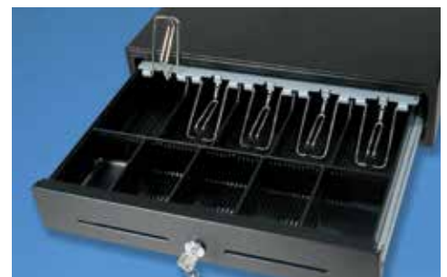
Extra Deep Insert With Adjustable Dividers to Support Canadian Coin and Currency