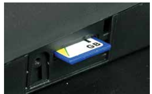
Upgrade Firmware, Save Programs and Reports With a Standard Built-In SD Card Reader or the USB Port