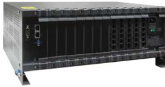
64-128 Zone System