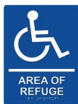
7044 Tactile Sign (8" x 6")