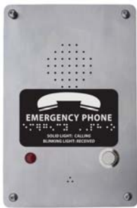
2100-956SIP (Stainless Steel Surface Mount)