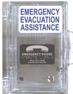
2100-956SIPC2 (Stainless Steel Surface Mount with Cover)