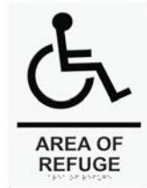
7043 Tactile Sign (8" x 6")