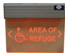
7050/7050D 120/277vac Lighted Sign (10-1/2" x 14")