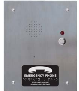
2100-958NSIP (Stainless Steel Flush Mount)