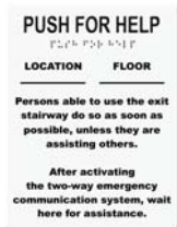
7049 Call Box Instruction Sign (8" x 6")