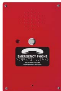
2100-984RIP (Exterior Surface Mount)