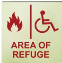
7041 Photo Luminescent Sign (7-3/4" x 7-3/4")