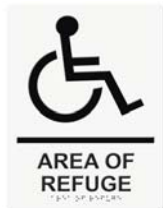
7043 Tactile Sign (8" x 6")