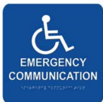
7087 Tactile Sign (8" x 8")