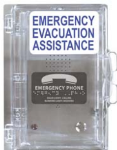
2100-956SIPC2 (Stainless Steel Surface Mount with Cover)