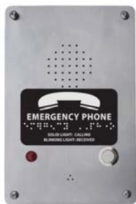
2100-956SIP (Stainless Steel Surface Mount)