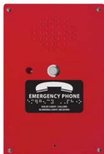
2100-984RIP (Exterior Surface Mount)