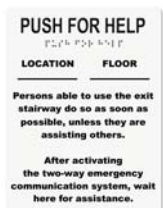
7049 Call Box Instruction Sign (8" H x 6" W)