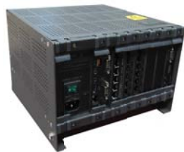
64-128 Zone System