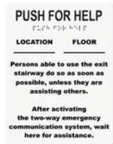
7049 Call Box Instruction Sign (8" x 6")