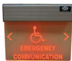
7050E/7050ED 120/277vac Lighted Sign (10.5" x 14")