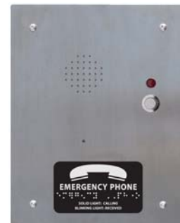
2100-958NSIP (Stainless Steel Flush Mount)