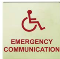
7041E Photo Luminescent Sign (8" x 8")