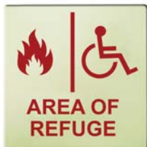
7041 Photo Luminescent Sign (8" x 8")