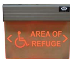
7050/7050D 120/277vac Lighted Sign (10.5" x 14")