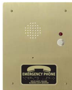
2100-958NMBIP (Antique Bronze Flush Mount)