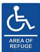
7044 Tactile Sign (8" x 6")