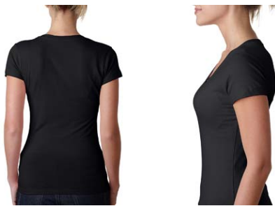
Featured Color: BLACK