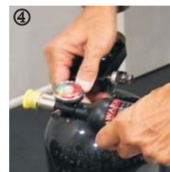
OPEN VENT & DETACH