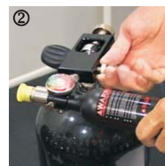
CLOSE VENT KNOB