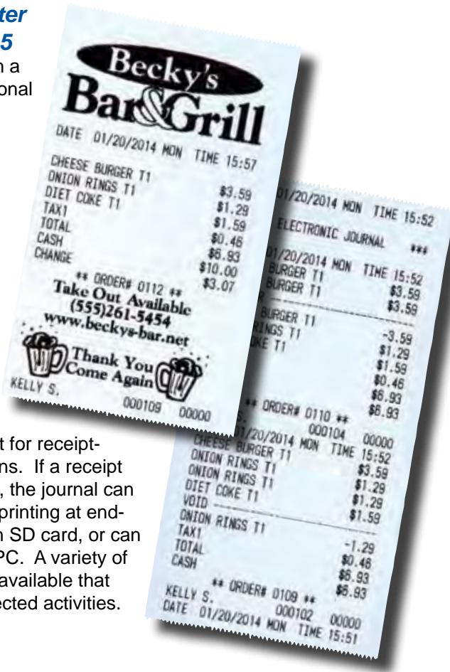
Receipt Featuring Graphic Logo and Message Shown 75% Actual Size

Single printer models are best for receipt-only or journal-only applications. If a receipt and a sales journal is needed, the journal can be archived electronically for printing at end-of-day, can be collected on an SD card, or can be polled and collected by a PC. A variety of electronic journal reports are available that allow you to quickly audit selected activities.