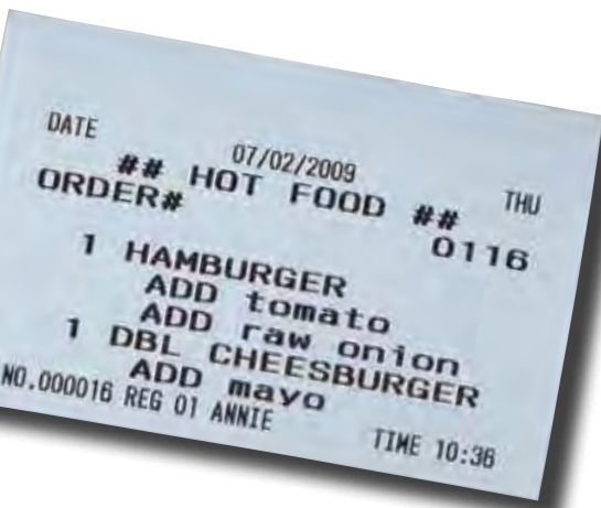
Kitchen requisition printed by the SPS-530 80mm receipt printer shown 75% actual size.