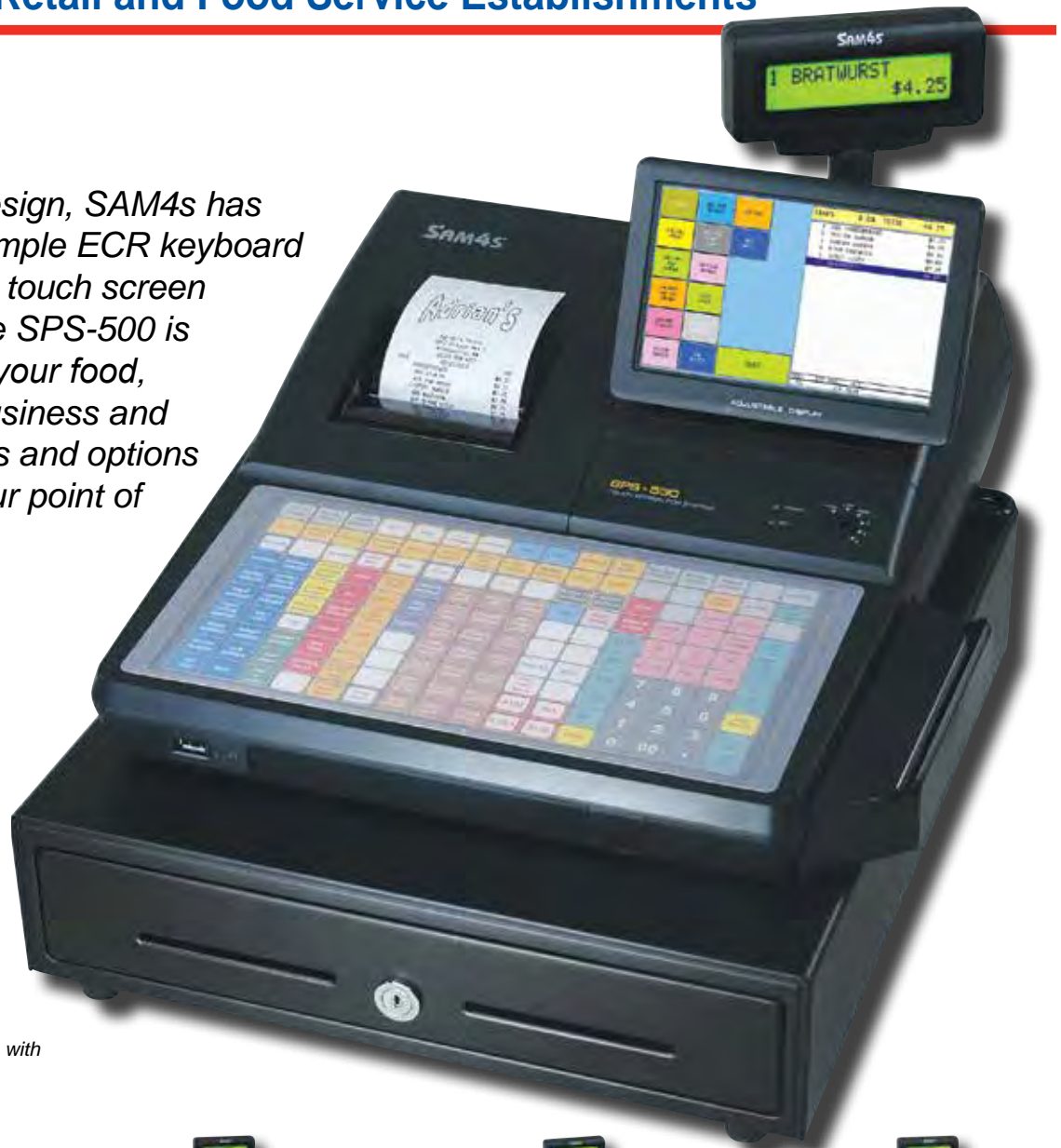
SPS-500 Series Hybrid ECRs Shown with Optional Card Reader

Featuring a hybrid design, SAM4s has combined fast and simple ECR keyboard entry with an intuitive touch screen operator display. The SPS-500 is easily configured for your food, beverage, or retail business and provides the functions and options you need to meet your point of service needs.