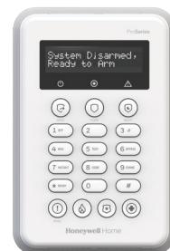
Wireless Touchpad: PROSIXLCDKP