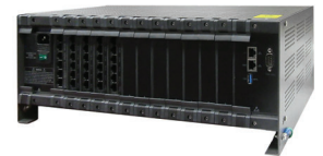
56-116 Zone System