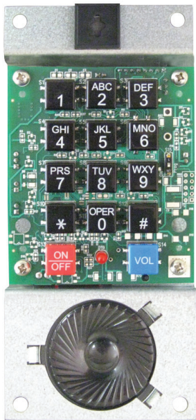
Model Number: 2400-875HE Size: 6-1/2" H x 3" W x 3/4" D Style: Interior Speaker Phone, Behind the Panel Mount