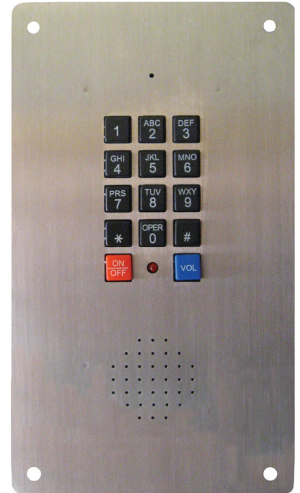
Model Number: 2400-878HE Size: 9-1/2" H x 5-1/2" W x 1" D Style: Interior Speaker Phone, Flush Mount, Stainless Steel