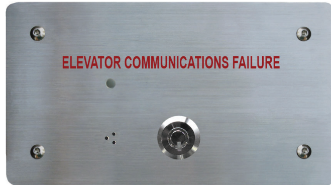
Flush or Surface Horizontal Mount