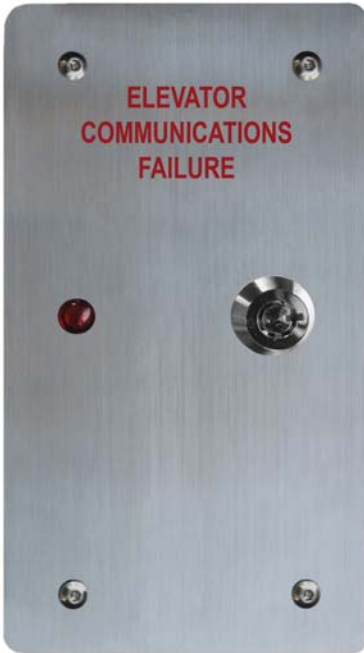
Flush or Surface Vertical Mount