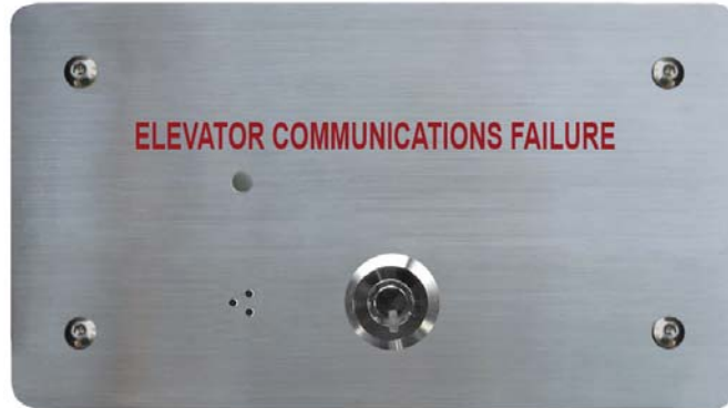
Flush or Surface Horizontal Mount