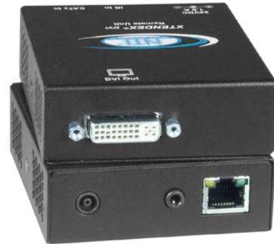
XTENDEX® ST-C6DVI-IR-300 (Remote and Local Unit)

The XTENDEX® DVI Extender transmits digital DVI video and IR signal up to 300 feet away from a DVI source over a single CAT5/6/7 cable. Each video extender consists of a local unit that connects to a single link digital DVI source and IR emitter, and a remote unit that connects to a DVI display and IR receiver.