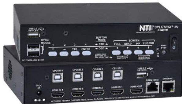
SPLITMUX-USB4K-4RT (Front & Back)