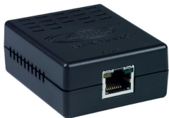
E-STS E-STHSB E-STHS-99