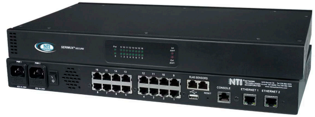
SERIMUX-S-16DP (Front & Back)