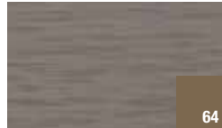
12 in. x 24 in. 64