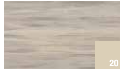
12 in. x 24 in. 20