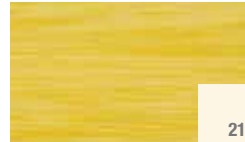
12 in. x 24 in. 21