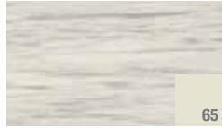
12 in. x 24 in. 65