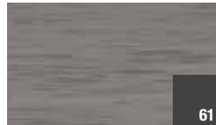
12 in. x 24 in. 61