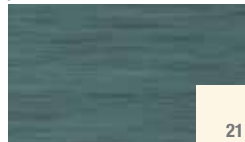
12 in. x 24 in. 21