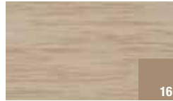
12 in. x 24 in. 16