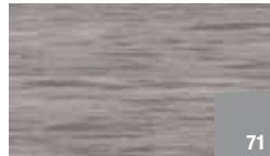
12 in. x 24 in. 71