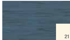
12 in. x 24 in. 21