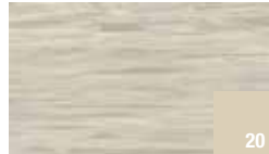
12 in. x 24 in. 20