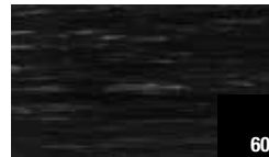
12 in. x 24 in. 60