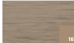
12 in. x 24 in. 16