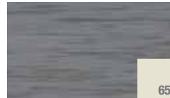
12 in. x 24 in. 65