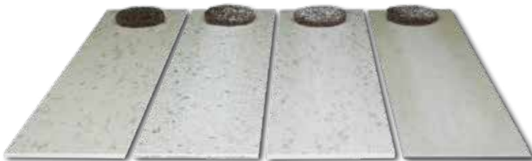
VCT with Diamond 10® Technology coating

Each product was scratched using an abrasive pad under a 12.5 lb. load for 20 passes, simulating commercial traffic.