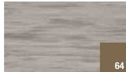
12 in. x 24 in. 64