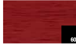
12 in. x 24 in. 60