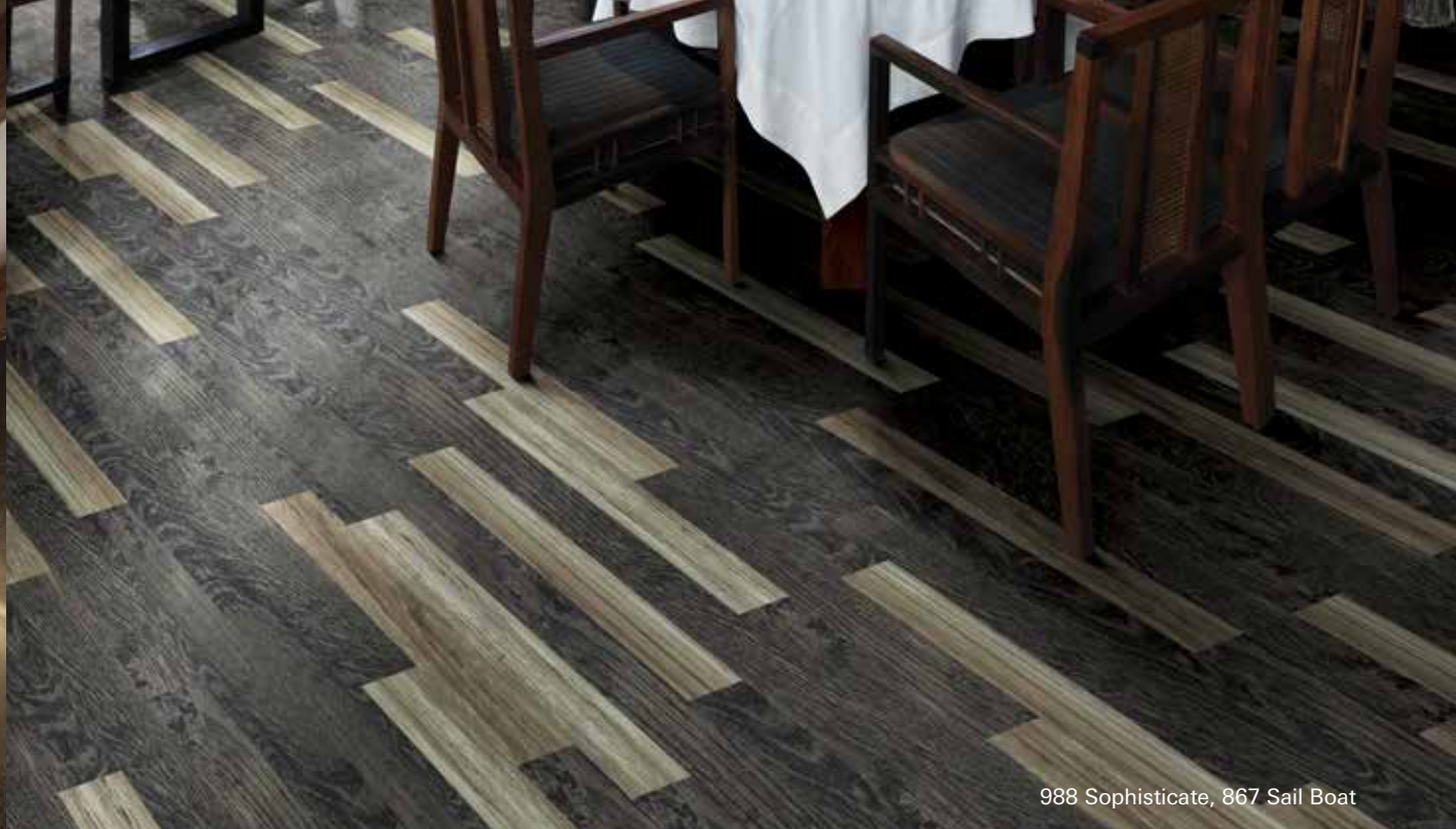
988 Sophisticate, 867 Sail Boat