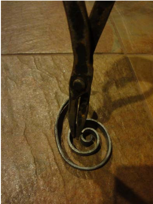
Adjusting a scroll with spreading tongs

And here are some ways spreading tongs can be used: