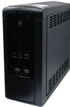
Part #: RP7700104S