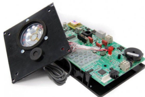
Also available in 2 piece option (Part #: PNB-2PC-5)