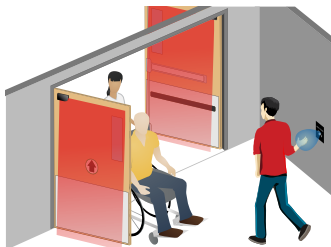
Full Energy Swing Doors