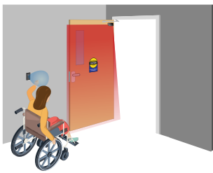
Low Energy Swing Doors