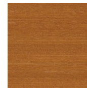
HONEY TEAK ATOHTQ / ATOHTG