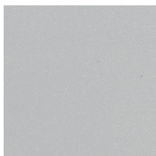
FLINT Argento, Travira