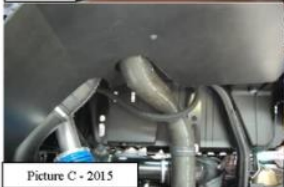
Picture C - 2015