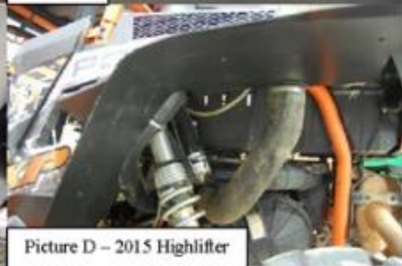
Picture D - 2015 Highlifter