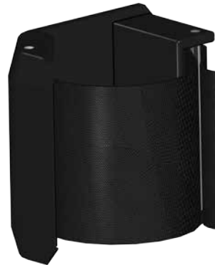
Mount Clamps x 2

Read instructions and view illustrations before beginning.