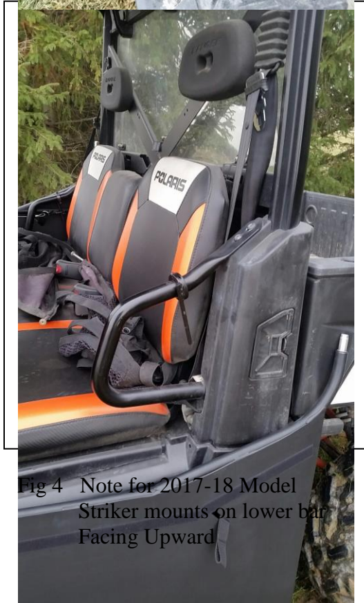
Fig 4 Note for 2017-18 Model Striker mounts on lower bar Facing Upward