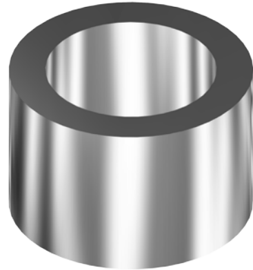
Spacer x 4

SuperATV strongly recommends using a Spring Compressor when removing and installing Springs.