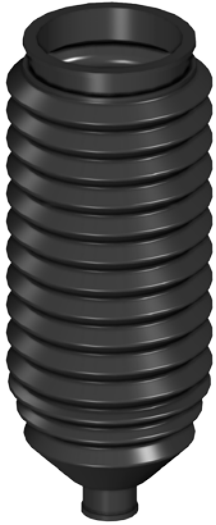
Boot X 2