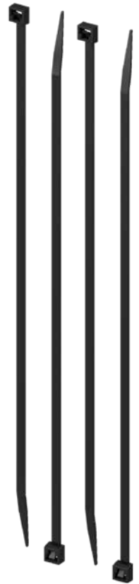
4 x Zip Tie