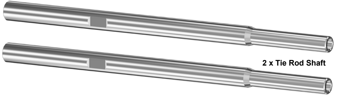
2 x Tie Rod Shaft