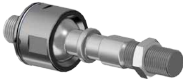
2 x Ball and Socket