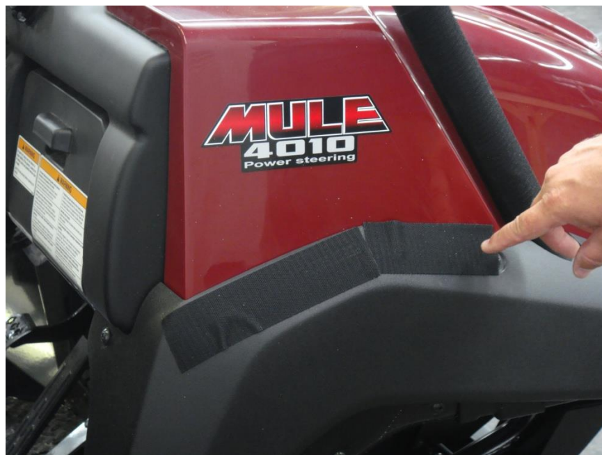
Adhesive hook reference N-Split 12" adhesive hook strip to curve corresponding to sewn in loop strips.