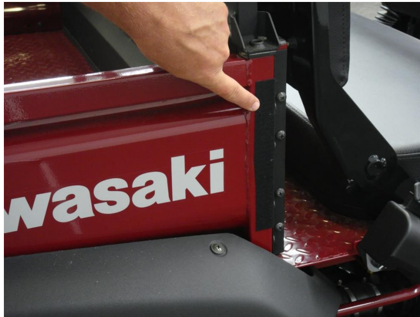
Adhesive hook reference G-Attach 1" adhesive hook strip vertically near front of cargo bed.