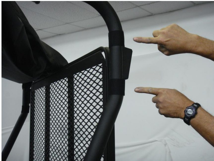
Adhesive hook reference D & E-Wrap adhesive hook strips horizontally around roll bar.