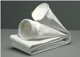
Dust Collector Bags