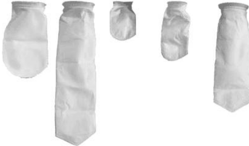
Size 1 Size 2 Size 3 Size 4 X100 7" x 16.5" 7" x 32" 4" x 8.25" 4" x 14" 6" X 20"