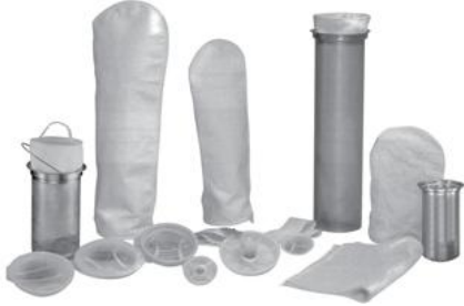
Liquid Filter Bags

Manufacturer and distributor of Industrial Air and Liquid filters, filter fabrics for an unlimited variety of industries and applications.