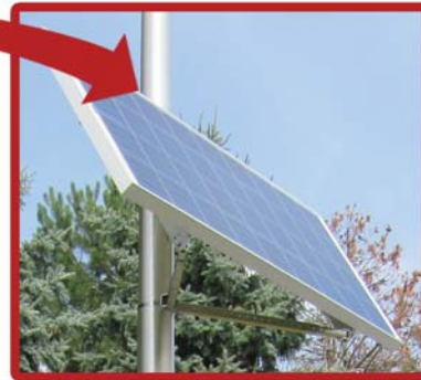
145 Watt Solar Panel (Mounting Bracket Included)