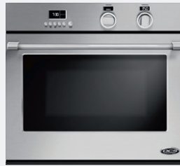
Any Wall Oven