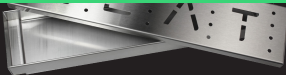
● Smoker Box