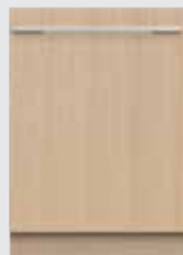
DISHWASHER SERIES 5 INTEGRATED DISHWASHER and qualifying accessories