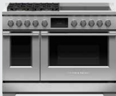
FREESTANDING RANGE 30", 36" OR 48"

GET A BONUS GIFT A DISHDRAWER™ DISHWASHER OR DISHWASHER