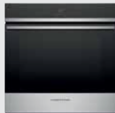
BUILT IN OVEN 24" OR 30"