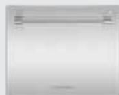
SINGLE DISHDRAWER™ DISHWASHER

GET A BONUS GIFT A DISHDRAWER™ DISHWASHER OR DISHWASHER