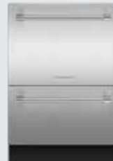
UPGRADE TO A DOUBLE DISHDRAWER™ DISHWASHER* *Additional cost depending on chosen model.