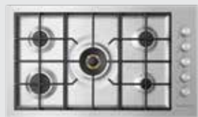
COOKTOP 24", 30" OR 36"

PURCHASE A NEW FREESTANDING RANGE OR BUILT-IN OVEN AND COOKTOP COMBINATION