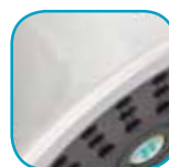
White Item# N2517