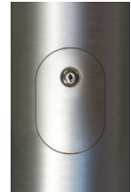
FOR 7-8" DIAMETER POLES