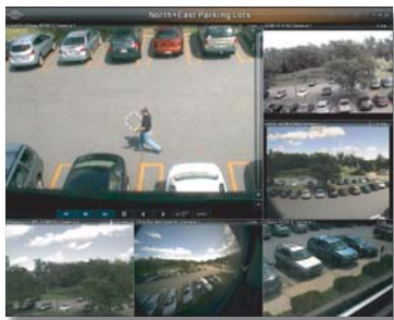
Instant Investigation during Live Monitoring

Access, investigate and export video of any incident within seconds