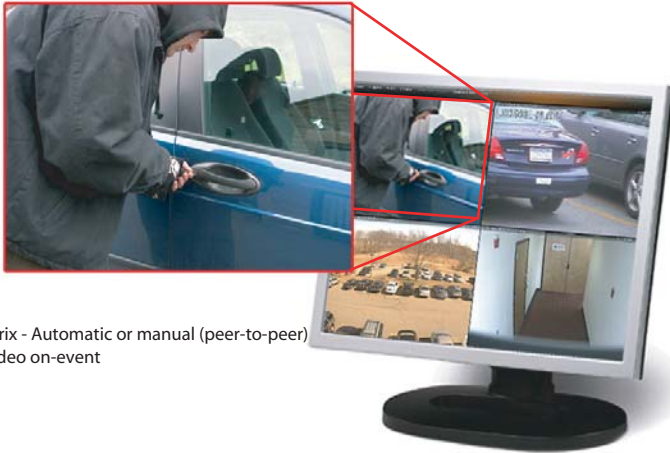
NetMatrix - Automatic or manual (peer-to-peer) push video on-event

Video Intelligence and Content Analytics With more video content streaming from ever-growing camera systems, the need for video intelligence has become imperative. Video content analytics allow the same number or fewer security operators to address the continually growing amount of video data. OnSSI's open-standards connectivity with physical security devices enable detecting events and exceptions, based on rules, automatically and in real time. Video Content Analytics modules add a higher level of recognition of exceptions and movement patterns, including directional movement, unattended objects and vehicles, motion tracking, crowd behavior and more. The result is the efficient and automatic detection of events and exceptions that are streamed to users - automatically - through intelligent remote, web and mobile video clients/controllers.