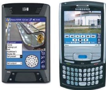
NetPDA & NetCell

PTZ-enabled Handheld IP Video clients/controllers