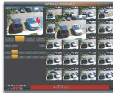
Time Slicer and Kinetic Motion Timeline

PTZ-enabled Handheld IP Video clients/controllers