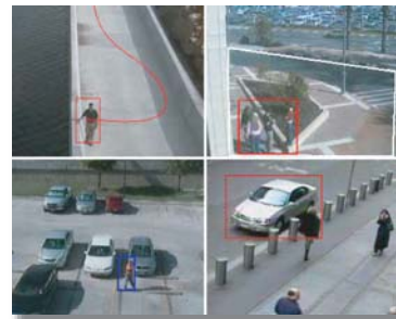
Video Content Analytics

Full Interaction with camera, including playback controls, optical and digital PTZ